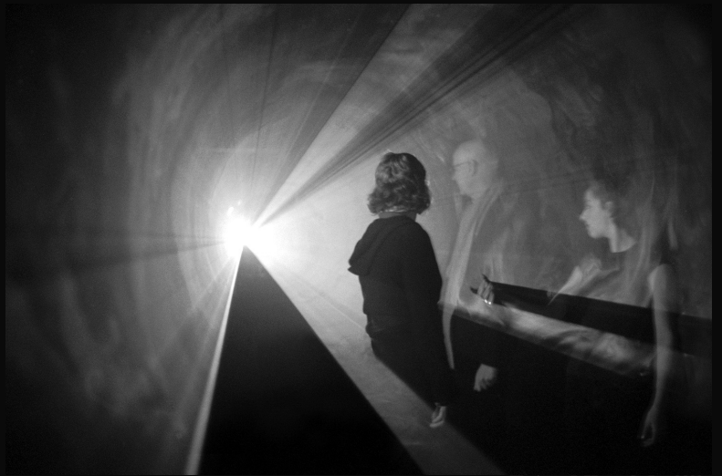
Photograph: Henry Graber, 2002

“...the most brilliant case of an observation on the essentially sculptural quality of every cinematic situation.”